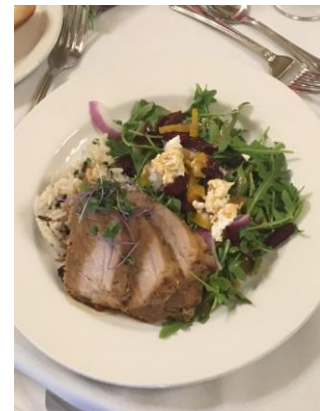
...an amazing meal.