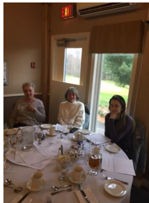
Three hungry golfers patiently waiting for.....