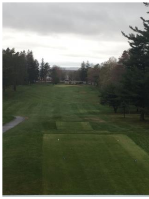
No Golf was played on this Opening Day